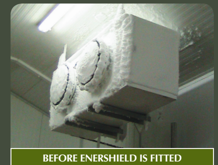
BEFORE ENERSHIELD IS FITTED