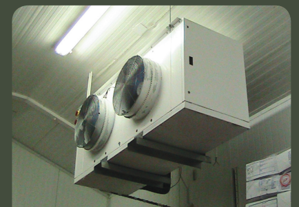
3 MONTHS AFTER ENERSHIELD IS FITTED